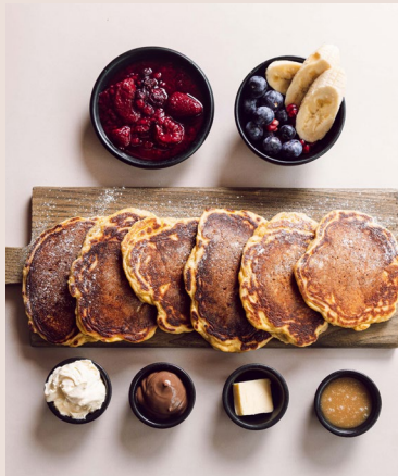
American Swaledale's smoked streaky bacon, banana, halloumi, house cream, 100% pure maple