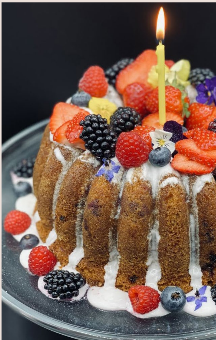
Forest fruits Bundt cake.